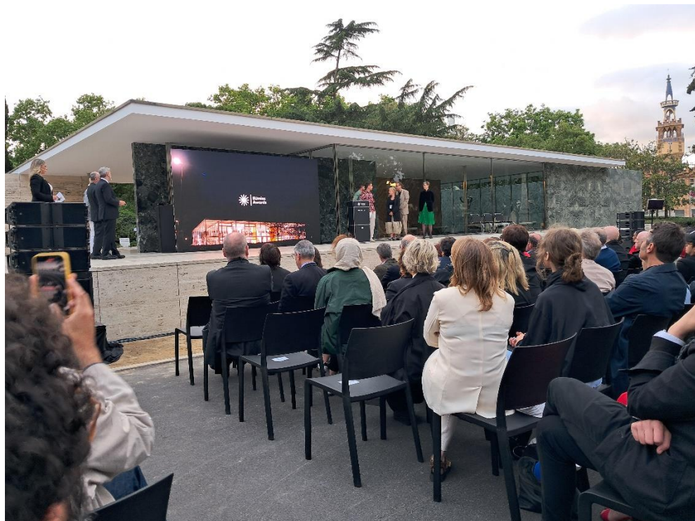
European Union's Mies van der Rohe Architecture Award 2024 Barcelona

The response from London: "In answer to your last point, we don't get any work in the UK either - it is a very hostile environment for architecture with a very poor competition culture. This is why we and so many of our esteemed colleagues, look for opportunities in Belgium. It certainly isn't to do with the quality of Flemish architecture."..... "I agree with you it is a problem but you should perhaps rather be happy that Flanders has managed to create a system through which at least some good contemporary architecture, and good architects, can thrive. I would like nothing more than to be able to focus on opportunities in my own city."