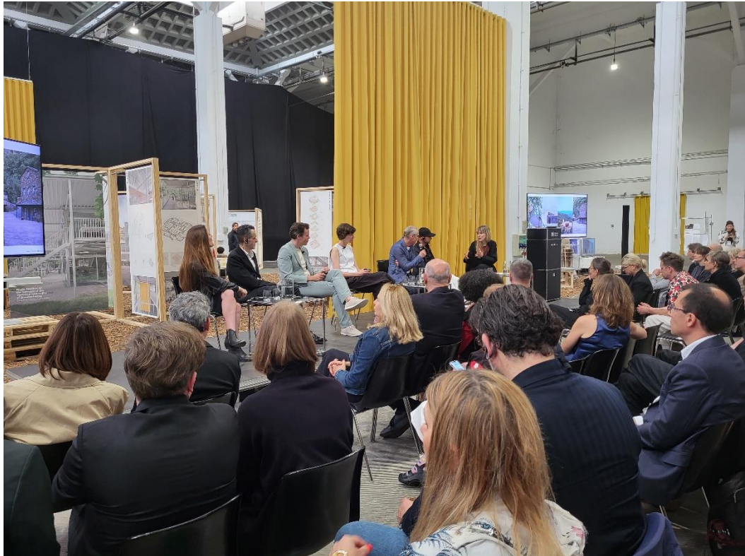
European Union's Mies van der Rohe Architecture Award 2024 Barcelona

Belgian agencies that collaborate with British agencies do this primarily to increase their chances of selection. An international team simply has more prestige! However, something has changed since Brexit. English agencies can no longer participate in the European Union's Mies van der Rohe Award. This is clear! England is no longer part of the European Union. This is thanks to Boris Johnson and Nigel Farage! Only when England starts negotiations again and expresses its desire to join the Union will it become possible again. For years now, Switzerland cannot and may not participate in the Mies Award, Switzerland does not belong to the European Union. Swiss architects are excluded, but their projects within the European Union are also no longer eligible, such as the excellent renovation of the Tate Modern in London designed by Herzog & deMeuron. The British people have chosen to leave the European Union and must therefore also accept the European rules. This is democracy.