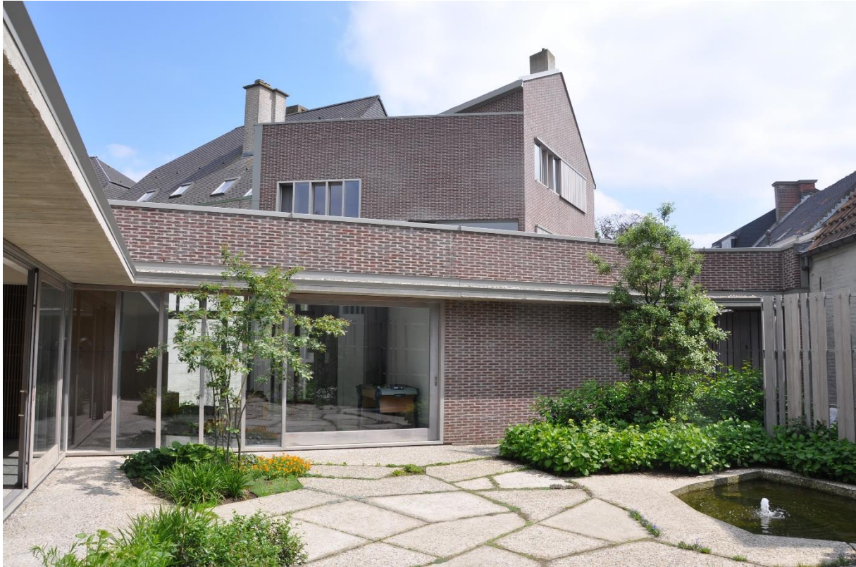
House in Opwijk

Many will wonder what this contribution to a “Flemish local vernacular” consists of? Is her vocabulary sometimes indigenous or even native? It is certainly not what can be read on Wikipedia about vernacular: “An example of vernacular architecture in Western Europe, and perhaps especially in Flanders, is the shed of verandas, garages, sheds, pigeon lofts and garden sheds at the back”.