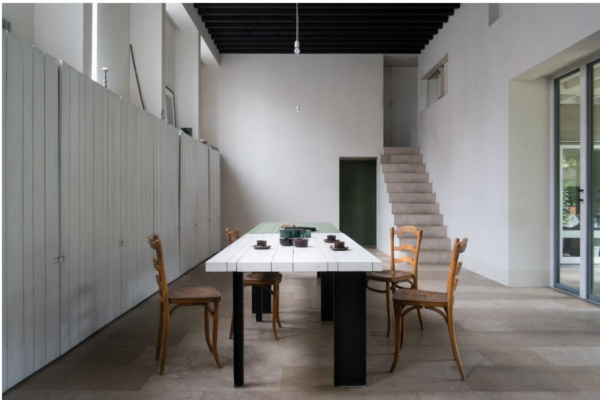
MJVH House in Ghent