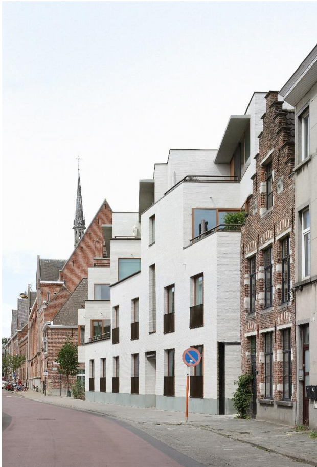
Housing in Ghent photo by Filip Dujardin